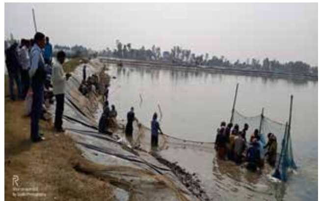
Inter State Exposure at NDRI Karnal, Hariyana dt. 03-05 February, 2020