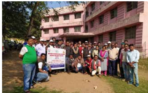
Demonstration under SMAE 2019-20