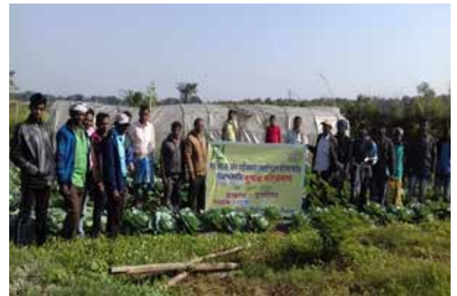
Vermi Composting training under Skill training of rural youth (STRY) at ATMA dt. 08 to 11 August 2019