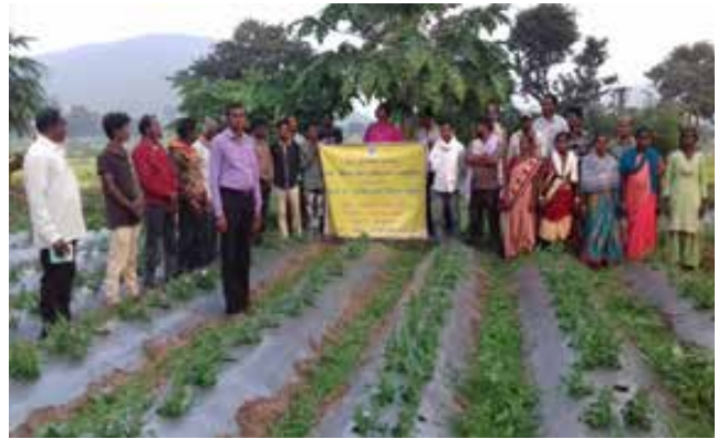
Within District Exposure at SNTI Bistupur dt. 23 October, 2019