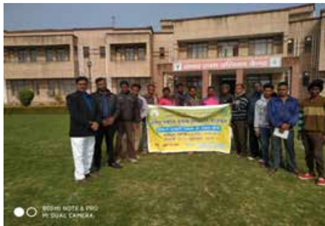
Inter State Training at KVK Nimpith W. Bengal dt. 09-13 December, 2019