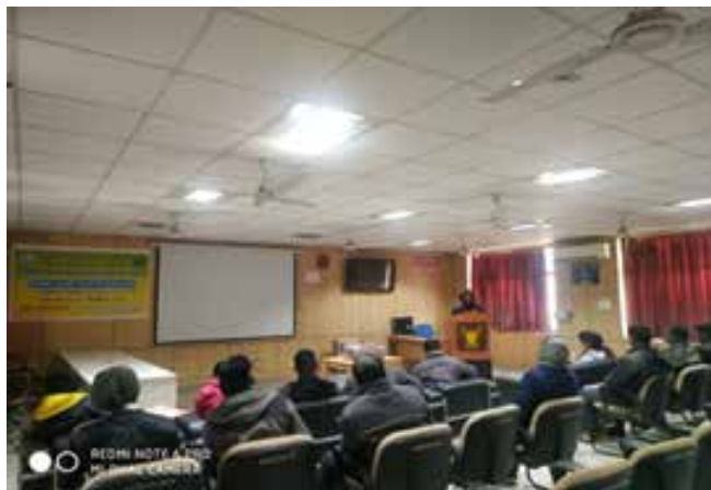
Inter state Training at IIPR Kanpur dt. 23-27 December, 2019