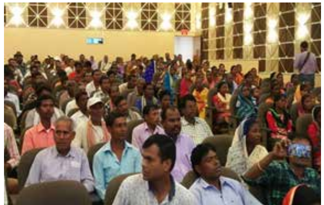
Within District Exposure at Farmer Field dt. 24 & 25 October, 2019