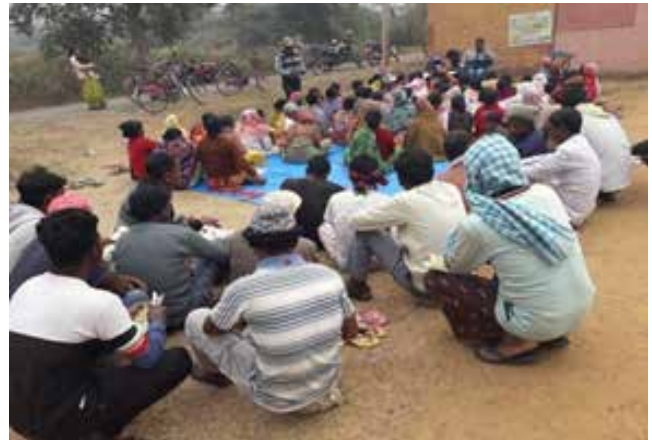
Inter State Exposure at Ramsagar W. Bengal dt. 07-09 January, 2020