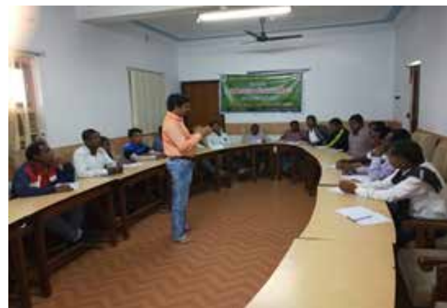
Within State Training at KVK Bisunpur Gumla dt. 11-15 February, 2020